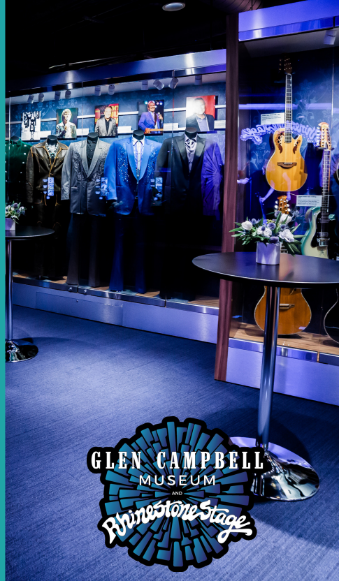
GLEN CAMPBELL MUSEUM AND Rhinestone Stage