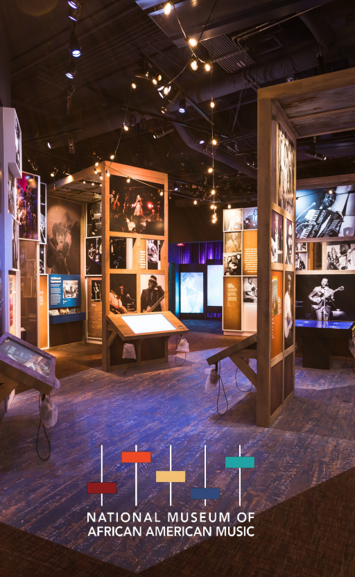
NATIONAL MUSEUM OF AFRICAN AMERICAN MUSIC