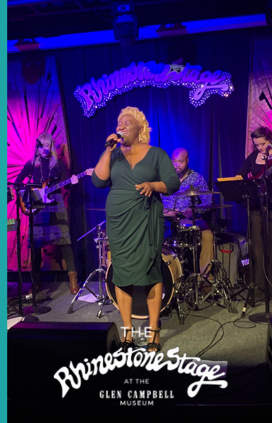
THE Rhinestone Stage AT THE GLEN CAMPBELL MUSEUM